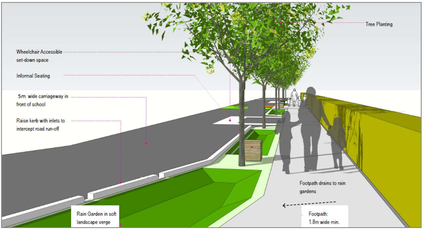
School Zone sketch for Scoil Mhuire na nGrást